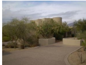
10274 Rising Sun Drive,

Comments: Must sell - seller carryback available, great terms! - Newly completed. This is awe-inspiring, charming santa barbara mission architecture. Large expansive vaulted ceilings, exposed timbers, soft arches and canterra stone accents. Open living concept, chef's kitchen, an entertainer's delight. Spectacular valley/city lights and mountain vistas. Located at the end of a quiet cul de sac in apache peak. Rich appointments throughout