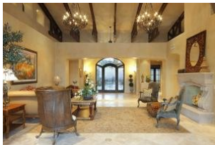
11226 Purple Aster

Comments: Spectacular city light & mountain views surround this masterfully situated tuscan villa. Stonehenge builder's estates, renowned architect jim conrad designed this with entertaining in mind. 30' automated sliding doors open to a lavish backyard oasis featuring a negative edge pool with swim-up bar, spa, kitchen, fireplace and covered outdoor living areas. Master suite includes his & hers baths, oversized closets & exercise room. Second