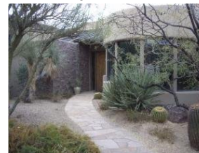
9360 Sky Line Drive,

Comments: Well maintained santa fe contemporary style 3-bedroom, 3.5 bath home. The large stacked stone fireplace in great room along with vaulted ceiling creates a dramatic feel as you enter the home. The kitchen has a gas cook top, upgraded cabinetry and granite countertops and backsplash. Tile throughout great room and kitchen. Master bedroom features built in shelving plus a fireplace and a private exit to the in-ground spa on the back