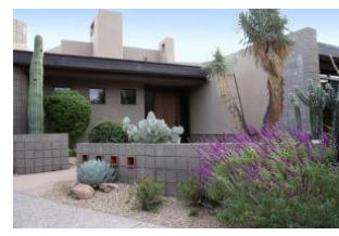
10567 Fernwood Lane,

Comments: Should be completed sometime in '09 by Cullum Homes. Golf course lot overlooking Geronimo's 15th fairway w/unobstructed city light views. Special features include a 2nd floor "mens grill" room with bath, office, game/billiards, fireplace sitting, wetbar, & glass pocket doors opening to deck. Primary areas include great room, wetbar, kitchen, formal dining, breakfast nook, 3 guest bedrooms, owners suite w/his & her closets, & exercise. Deferred