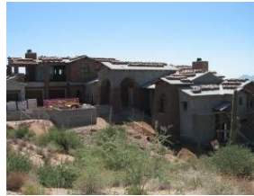
9879 Chiricahua Pass,

Comments: Lantana floor plan with excellent views. Faces south for maximum winter sun and enjoys views of McDowell mountains, fairways of the Renegade Golf Course, city lights and winter sunsets. Never before offered for sale, this one owner home is the ideal second (lock it and leave it!) home for winter residents. Just a short walk to the Renegade and Sonoran Clubhouses. Price includes equity golf membership in the club at Desert Mountain featuring 6 Jack Nicklaus signature