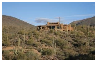
9717 Mariola Way,