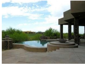
41455 111th Place,