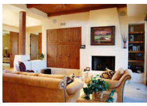
9939 Broken Spur

Comments: Very private custom home with expansive golf course views (16th fairway). This new spec home features home theater, office, 850 bottle wine room, guest casita w/separate entrance, chef's kitchen including sub zero, wolf gas cooktop, double ovens, & warming drawer. Master suite w/fireplace. Master bath with jetted tub & steam shower. Great room w/stone fireplace & vanishing wall of glass that open to lovely golf course, mountain, & city