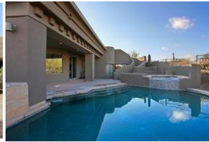
10090 Golf Trail,

Comments: Wonderful territorial/santa fe home in the village of sunrise. Situated on a large corner lot with city light and sunset views with plenty of room to add a pool and spa. Open and bright great room floor plan with a large office den. Two guest quarters with separate entrance. Wood floors, wood beams and 6 kiva fireplaces makes this home a charm. Deferred equity golf membership included in the sales price.