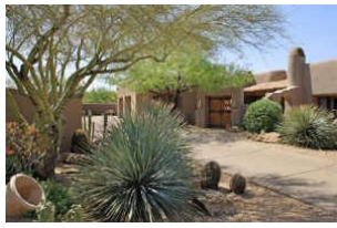
10067 Golf Trail,

Comments: Spectacular soft contemporary custom home under construction in the gamble quail subdivision at desert mountain. Come take this opportunity to add your finishing touches to one of the most well designed properties in this most prestigious community. A partial copper roof is just one of the special features planned for this four bedrooms, four baths with two half baths plus media room, smart home system and more. Bank approved price - quick close