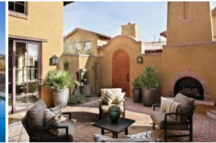
10504 Horizon Drive,

Comments: Just completed total remodel and is move in ready. Fresh new feeling throughout this immaculate golf view home on over 1 acre. All new plush carpet, new paint inside and out, new viking cook top, dishwasher and micro, new rubbed oil bronze fixtures, new roof, new stucco, and all cabinets newly refinished in a gorgeous dark glaze! Enjoy the gourmet kitchen with granite counters and stainless steel