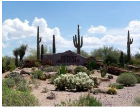
37905 95th Way,