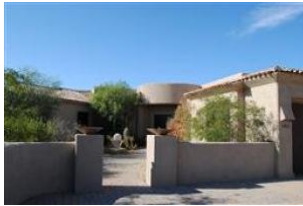
38520 103rd Place,