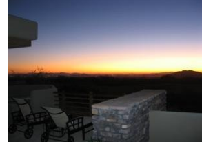
40106 111th Place, #35,

Comments: Recently upgraded,this lovely home provides an open floorplan that is perfect for desert living. The spacious living room with granite wet bar, cozy gas fireplace & vaulted tongue & groove ceiling adjoins the lovely dining room. The well-planned kitchen with its generous island & breakfast bar, gourmet appliance package, granite counters, pantry & breakfast nook is ideal for entertaining. The master suite provides access to the terrace & includes a