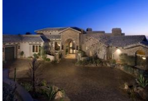
42237 107th Place,

Comments: Reo-bank owned property-being sold as-is this is in one of the most sought after areas of maricopa county (desert mountain) all new cabinets in kitchen, great room floor plan, four bedroom suites. Redesigned chef's kitchen features viking professional appliances, double ovens, warming drawer, refrigerator and freezer and a generous pantry. The master bedroom suite is spacious and has a large sitting area, his and her