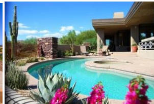
10081 Taos Drive,

Comments: This is not a short sale but it is priced like one! Enjoy exceptional quality and privacy in this old world masterpiece. A spectacular entry with 4 unique water features welcomes you to this custom home. The open floor plan offers a huge beamed great room with wet bar, formal dining room, chef's kitchen with high-end cabinetry and appliances, luxurious master suite/bath complex, 2 large guest suites, den or 4th bedroom with hardwood