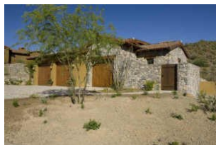
9481 Old Wrangler