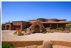
9533 Rising Sun Drive,

Comments: Seller financing available!! A tranquil setting featuring 3 bedrooms 3.5 baths, pool/spa, and a great room design. Lots of mature vegetation, big boulders and water features. Degm not included