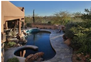
10670 Palo Brea Drive,

Comments: New reduced pricing! Newly completed, fully furnished ranch-style home, cradled in the natural beauty of the continental mountains offers privacy, luxury and spectacular views. Lovely gated courtyard entry, with fireplace and lush landscaping, sets the tone for the splendid great room floor plan and attached guest casita. Alder-wood cabinetry, granite countertops, viking appliances, wood beamed ceilings and distinctive accents of