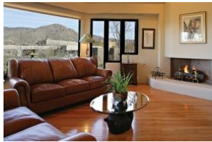
10951 Salero Drive,

Comments: Major price reduction! The outstanding great room floor plan encompasses a sumptuous master suite plus 4 additional private suites, a home theater, a well-designed office, formal dining alcove, & a spacious gourmet kitchen with massive island breakfast bar. The meticulous attention to detail is unparalleled with hand plastered walls, native stones, mesquite & alder cabinetry & doors, distinctive viga ceiling treatments,