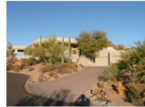
10648 Prospect Point

Comments: Built in 2009 this charming single level home in the village of eagle feather offers a functional great room floorplan with 4 bedrooms in the main house or three and a study plus a casita. Wonderful finishes include granite counter tops, travertine floors and top of the line appliances. Retractable glass doors from the great room lead to a large covered patio with fireplace, built in bbq, heated pool and spa with fire woks. List price includes the full deferred