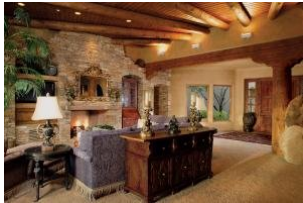
10887 Purple Aster