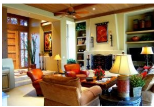
9819 Broken Spur

Comments: Brand new soft tuscan certified green built home in gamble quail subdivision of desert mountain. Enjoy gorgeous mountain views by day, and city light views at night. Green build certification ensures energy efficiency and responsible building practices for minimal environmental impact. Completed in april 2009, this entertainers delight features grand structural beamed ceilings in great room and patio, private entry courtyard, state of the