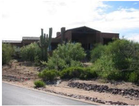
38005 95th Way,